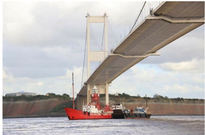
Helwick passing under Severn Bridge